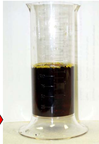
120 ml/4.06 ounces of Brown Tone concentrate