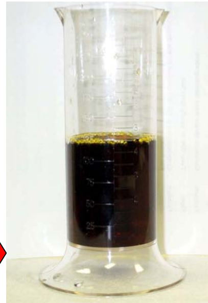
120 ml/4.06 ounces of Brown Toner concentrate